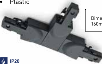
Dimensions: 160mm x 20mm x 100mm