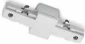
Dimensions: 96mm x 30mm x 20mm