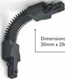
Dimensions: 30mm x 20mm x 330mm