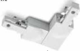
Dimensions: 90mm x 20mm x 100mm