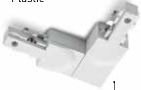
Dimensions: 90mm x 20mm x 100mm