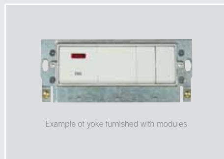
Example of yoke furnished with modules

AB Antique Brass, BR Polished Brass, SB Satin Brass, CH Polished Chrome, SC Satin Chrome, BN Black Nickel, SS Stainless Steel.