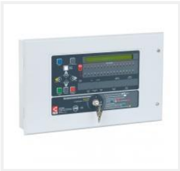
XFP 2 Loop 32 Zone Addressable Fire Panel (XP95...