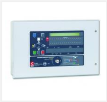
XFP 2 Loop 32 Zone Addressable Fire Panel (Hoch...